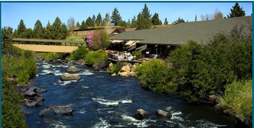
The Riverhouse Hotel & Convention Center on the Deschutes River, Bend, OR